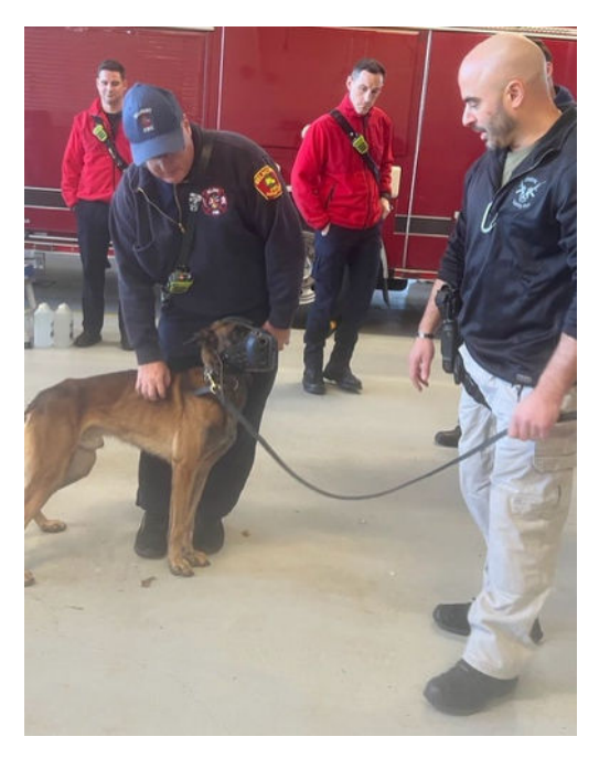
EMTs and Paramedics Participate in Nero's Law Training

The Fire Department provides first response Basic Life Support (BLS) and Advanced Life Support (ALS) transporting service for the community. This equates to faster access to basic care from EMTs as well as advanced care from Paramedics including advanced airway control, intravenous (IV) access, medication administration, cardiac monitoring, interpretation, and treatment/defibrillation. These highly trained Paramedics work together with our Emergency Medical Technicians (EMTs) to transport patients to area hospitals.