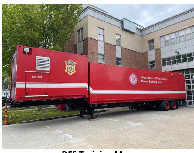
DFS Training Maze